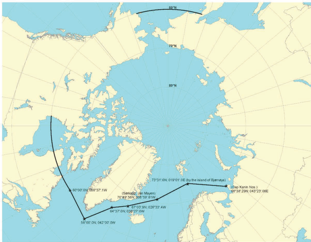
Figure 2 – Maximum extent of Arctic waters application 3