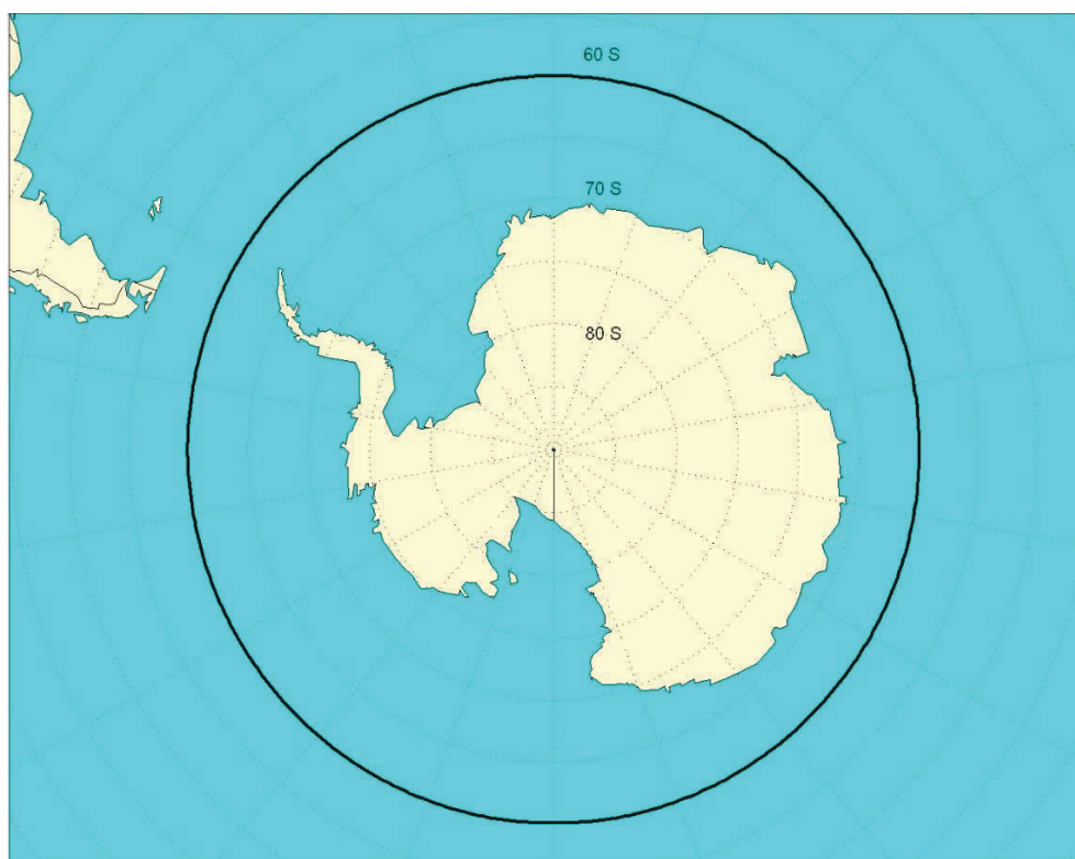
Figure 1 – Maximum extent of Antarctic area application 2